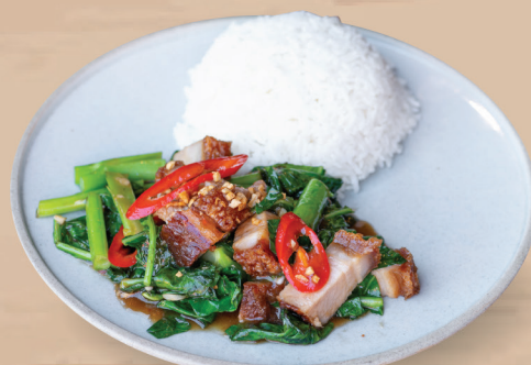
KANA MOO GROB