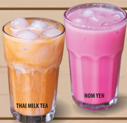
THAI MILK TEA