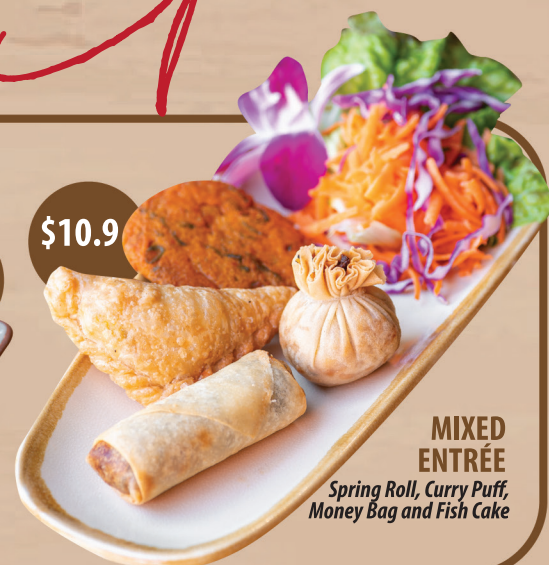
MIXED ENTRÉE Spring Roll, Curry Puff, Money Bag and Fish Cake