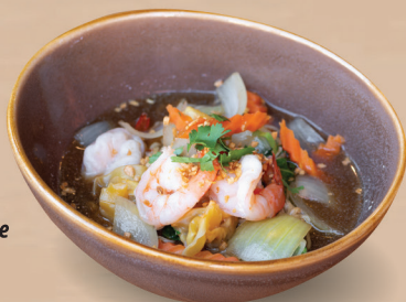
WANTON & FRESH EGG NOODLE SOUP

Minced chicken with chilli, garlic and basil blended sauce with fried egg.