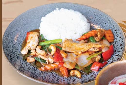
CASHEW NUT STIR-FRIED