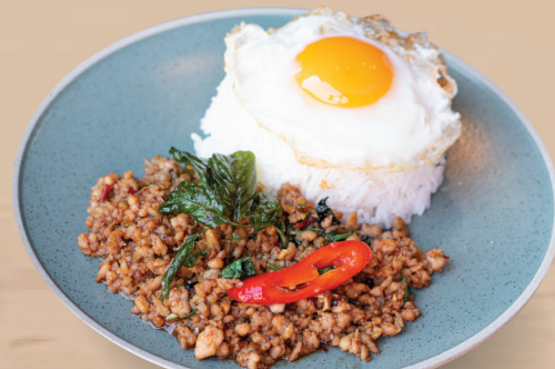
CHILLI BASIL CHICKEN-MINCED WITH FRIED EGG