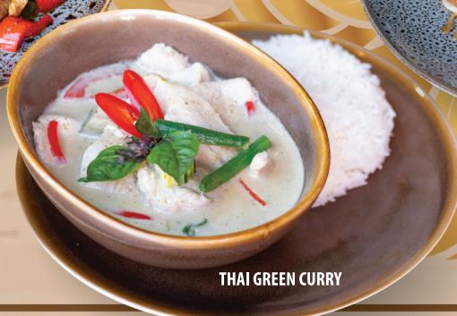
THAI GREEN CURRY