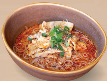
LAKSA NOODLE SOUP