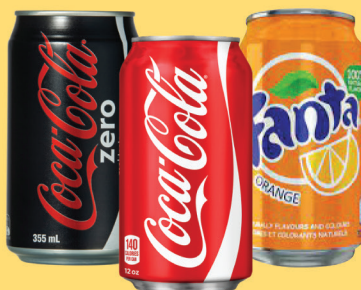
Coke / Coke No Sugar / Diet Coke / Lemonade / Lemon Squash / Fanta

SELECT A CAN OF SOFT DRINK OR A BOTTLE OF SPRING WATER