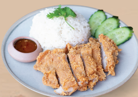
CRISPY CHICKEN RICE