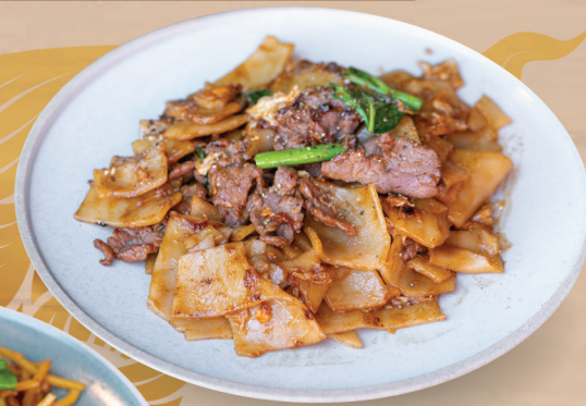
PAD SEE EIW