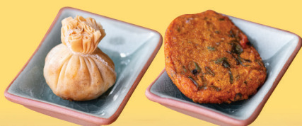
MONEY BAG / FISH CAKE