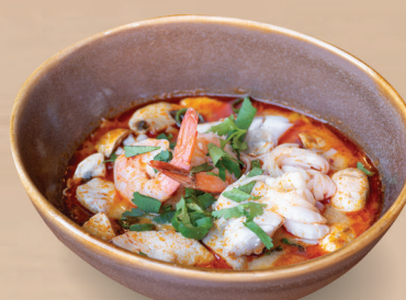
TOM YUM NOODLE SOUP