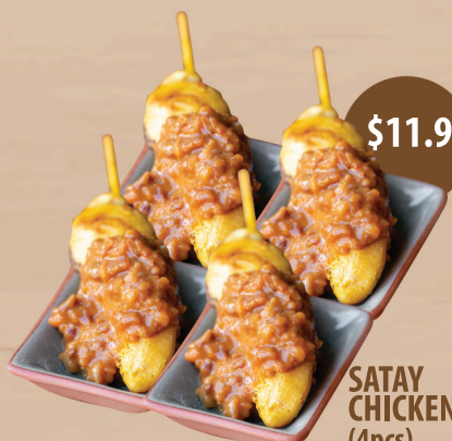
SATAY CHICKEN (4pcs)