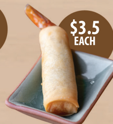
PRAWN IN A BLANKET