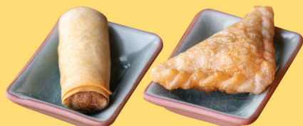
SPRING ROLL / CURRY PUFF